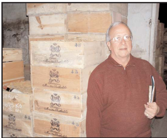
1945 MOUTON AND 1945 CLYDE AT MAHLER BESSE CELLARS

After two very easy and quick flights, we should have figured that this year would be different than years past. What we found out after nine days of tasting through some 400 wines from 2005 vintage was that this was one of the easiest vintages to taste--no mouth-searing tannins or green fruit or acid finishes here. Though the tannins were very high (one of highest on record), and the acids were high, the fruit was so ripe and round in most wines that the young harsh qualities of a new vintage were completely masked by the enormous fruit content. Also