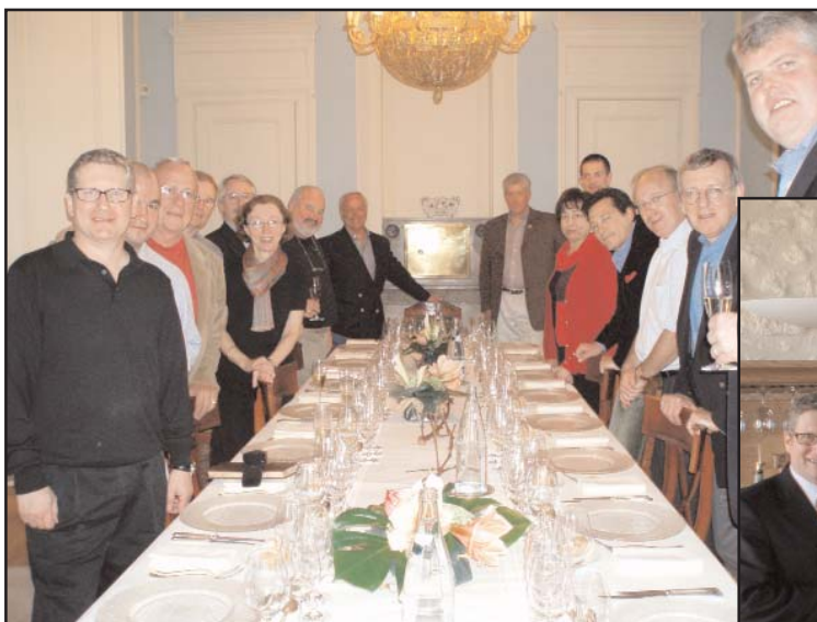
FIRST DINNER AT CH. PICHON BARON WITH THE MEDOCAINE GANG