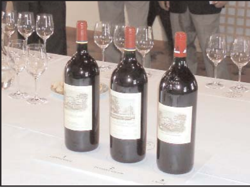
A GREAT TRIO: CARRUADES DE LAFITE, CH DUHART MILON AND CH LAFITE ROTHSCHILD