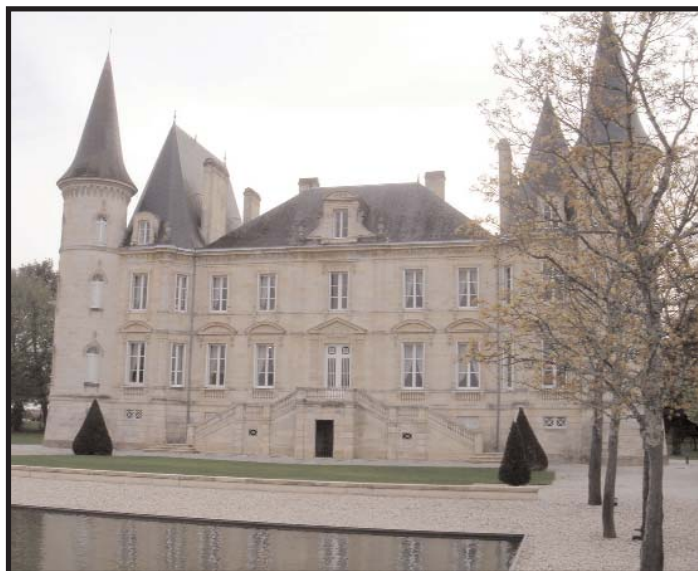
OUR HOME AWAY FROM HOME: CH PICHON BARON

Tasting in Bordeaux April 2nd- April 12th, 2006