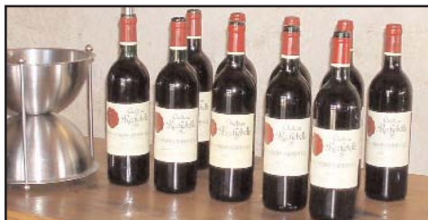
CH ROCHEBELLE, A SUPERB VALUE FROM ST-EMILION

This property continues to improve. Slightly new wave wine with fine