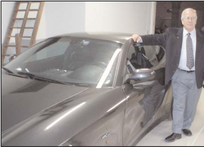
K&L VISITS THE CHATEAUX IN STYLE: A FERRARI 612